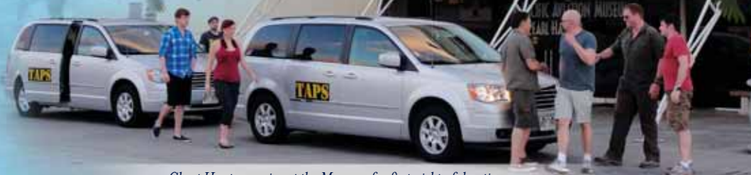
Ghost Hunters arrive at the Museum for first night of shooting.

Yes, they did record evidence of paranormal activity, but those of us who work here already knew that! The episode aired in a one-hour special on June 1st on the SyFy channel. You can also watch full episodes on hulu.com. Stay tuned, there is more to come!